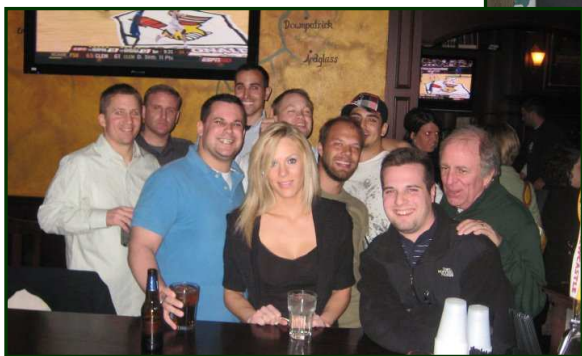
(At Dublin Square)