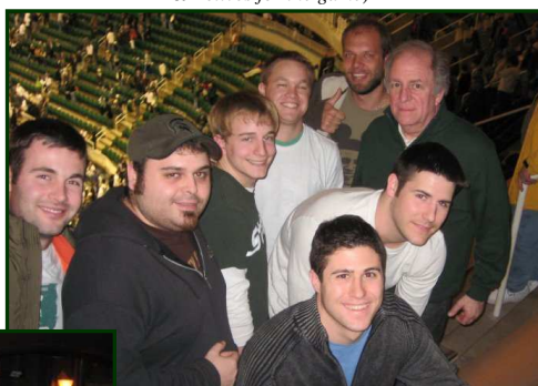
(East Lansing Mayor Vic Loomis joins Alpha Pi Alumni & Actives for the game)