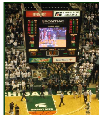
(Sparty rolls the Hoosiers at the Breslin Center)